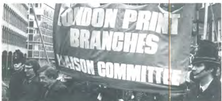
Unity is needed

The new technology is rapidly making a nonsense of the craft divisions within the workforce and points urgently to the need for the formation of a single industrial union within the printing industry. The first step to such a union should be the formation of joint union committees to co-ordinate action against Maxwell's proposed package of cuts. The building of such unity in action has to be demanded of the leaders of all the unions involved. But if they will not take the lead, then rank and file militants must shoulder the responsibility by forming such committees unofficially.■