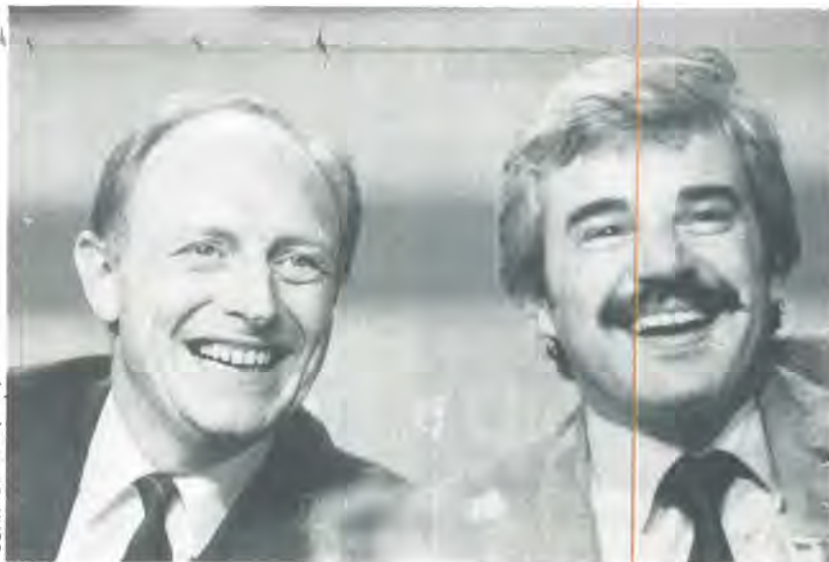
Witch Finders General - Kinnock and Whitty