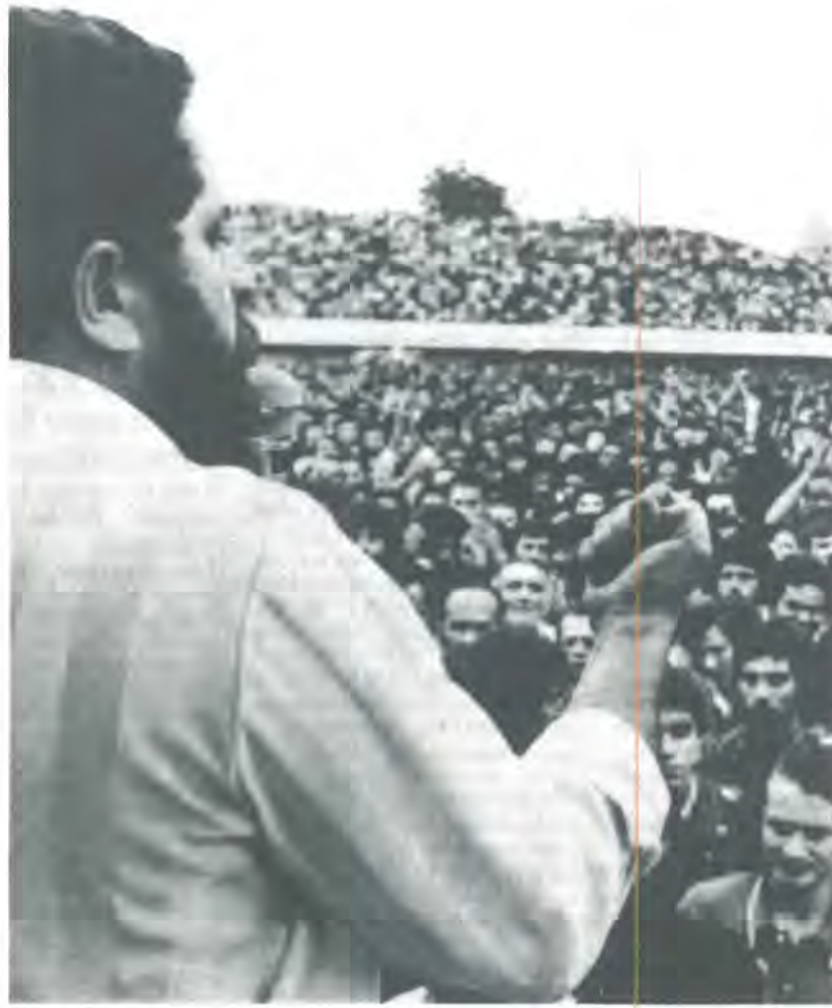
PT leader Lula

Then, during the process of selecting a PDS candidate for the impending Presidential elections (January 5th 1985), this grouping solidified into an open opposition within the PDS. The selection