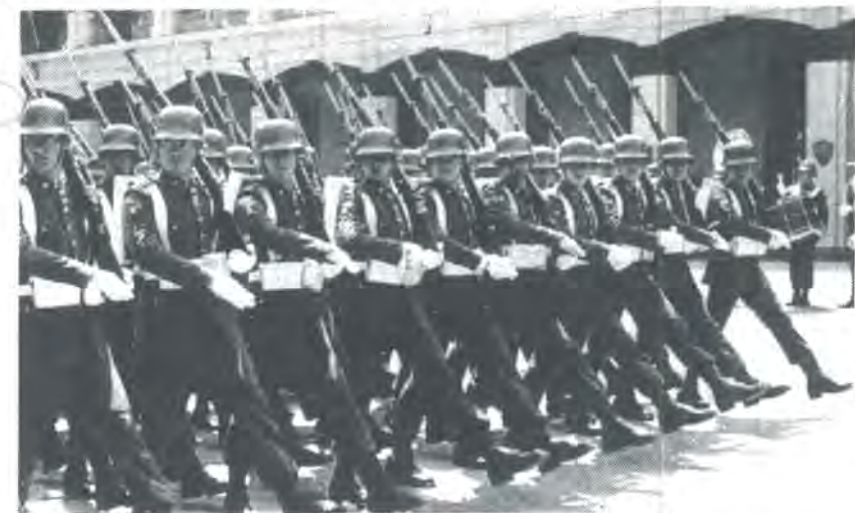
Chilean army - still in control

ment buildings etc. A recent report to the central committee declared the aim was to render "a state of generalised rebellion which will paralyse the country". At the same time they have repeatedly declared their willingness to support a bourgeois government which represented a break with military rule, preferably a "government of advanced democratic tendencies, with a socialist perspective". Thus the armed actions remain for the PCC a negotiating tactic, aimed not at breaking the army, but strengthening its so called reform wing and forcing it "back to barracks" and out of the political arena.