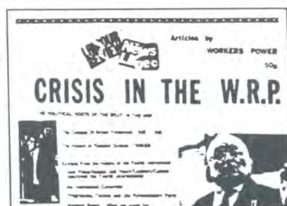
Send your order to: Workers Power, BCM 7750, London WC1N 3XX

Handsworth Defence Campaign picket of Winson Green Prison every Saturday from 12pm onwards HDC telephone 021-554 2747 Support the Jailed youth!