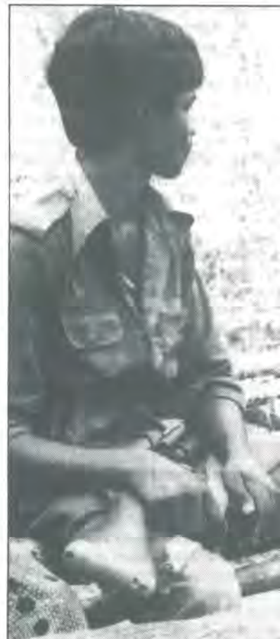
LTTE guerillas - is the armed struggle

Further, in the 1970s the government institutionalised Sinhala as the only state language and has promoted Sinhalese colonisation of the predominately Tamil areas, particularly in the East to break down Tamil national cohesiveness. ■