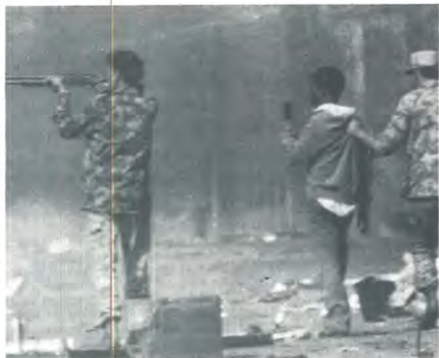
Multi-racial armed forces still gun down blacks!

That is why they - and their allies, the enormously privileged white workers - will fight tooth and nail against any movement which threatens to destroy Apartheid itself. Events since Lipton wrote her book and the growing resistance of the Afrikaaners to political change testify to the irreformability of the South African state through gradual and peaceful methods. It needs to be smashed from top to bottom. Only the black working class can do that - not the "enlightened self interest" of sections of South Africa's capitalists. ■