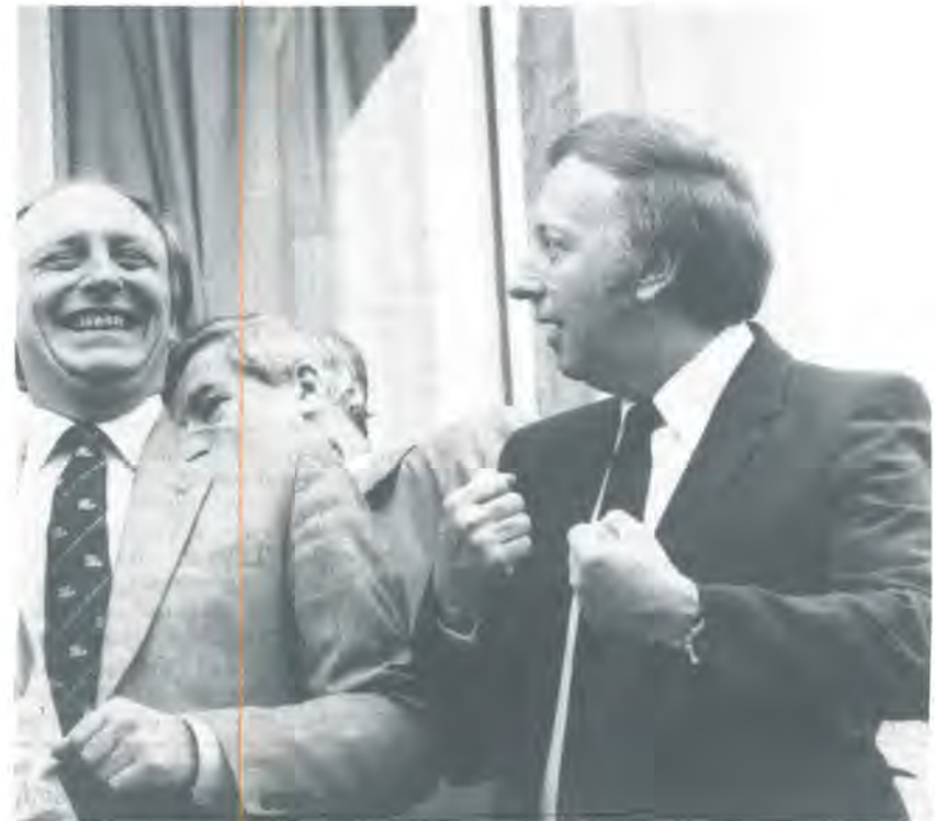
Kinnock can now afford to laugh at Scargill's fighting talk

letters, like The Armthorpe Tannoy , must be launched to supplement the Rank and File Miner . Every closure must be met by action that is spread within and across areas. In particular Kent, as a militant area, could begin building a fighting alliance of the areas around resistance to closure of Betteshanger. The recent election in South Wales of Des Duffield, a Scargill supporter, by a sizeable majority over the Kinnockite (and Euro supported)