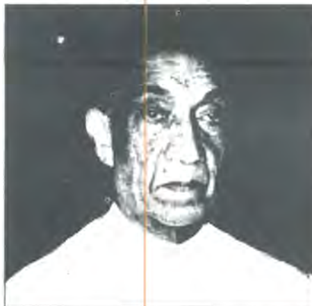
UNP leader Jayawardene